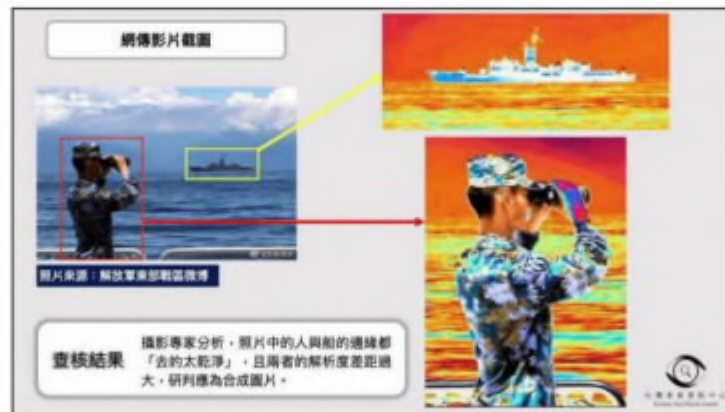
Image 3: A Taiwan-based fact-checking initiative discovered a frequent image used by PRC state media outlets to prove the PLA Navy sailed close to Taiwan's east coast was in fact a composite.