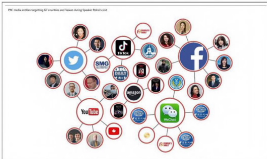
Image 1: A snapshot of the social media accounts mobilized to discredit Speaker Pelosi's visit and reproach Canada for its statement condemning military exercises in the Taiwan Strait, including clockwise from top left: "Wolf Warriors" like former PRC Ambassador to Canada Lu Shaye, covert PRC state-controlled media on TikTok, multi-lingual state media "influencers" on Facebook, PRC state affiliated YouTube vloggers, and local WeChat news accounts targeting Canada's Chinese diaspora.

Over the past three years, Twitter, Facebook, and YouTube have rolled out “labelling policies” that notify users when they are viewing content from a PRC state-controlled media entity. 4 RRM Canada tracks these labeled accounts as part of its monitoring of the information space for malign foreign activity. For this report, the unit tracked content published in English, French, simplified Chinese, and traditional Chinese. All RRM Canada reporting is subject to an ethical and methodological framework. 5