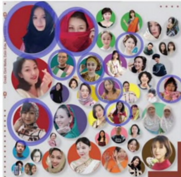
Image 5: Miburo has identified these personalities as CRI staffers. Staffers circled in blue posted about Speaker Pelosi’s visit to Taiwan. The coloured inner circle represents the language spoken by CRI staffer. Red = Arabic, Dark Green = Hausa, Purple = Spanish, Yellow = Urdu, Orange = Hindi, Light Green = Sinhalese, Light Blue = Hebrew, Brown = German, White = Other languages, including Japanese and Farsi.

RRM Canada judges that CRI staffers act as important conduits for the PRC to deliver its narratives to countries in the Global South and conduct their work largely undetected by governments or publics in target countries.