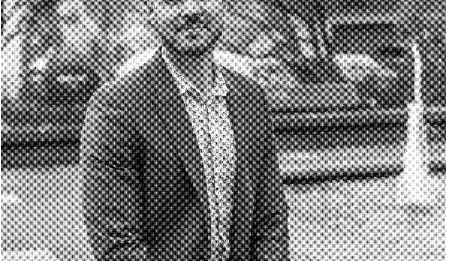
Brad West, mayor of Port Coquitlam

Port Coquitlam Mayor Brad West, a longtime critic of Canada's response to efforts by the Chinese government and its business interests to curry favour in B.C., wasn't surprised by what he called an "impotent and tepid response."